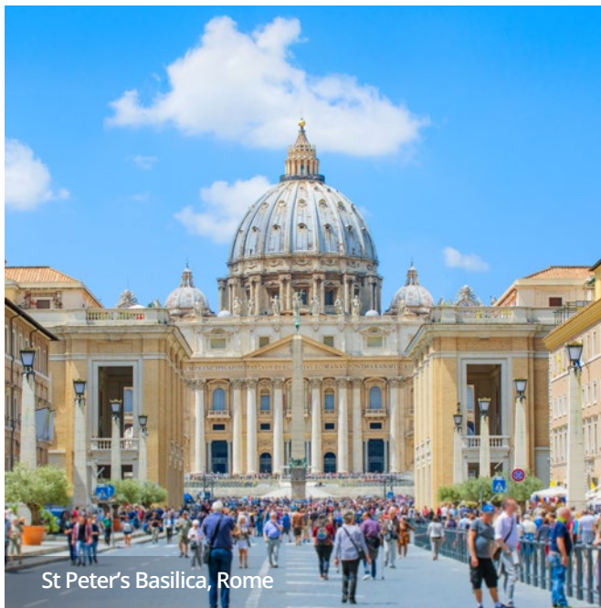
St Peter's Basilica, Rome