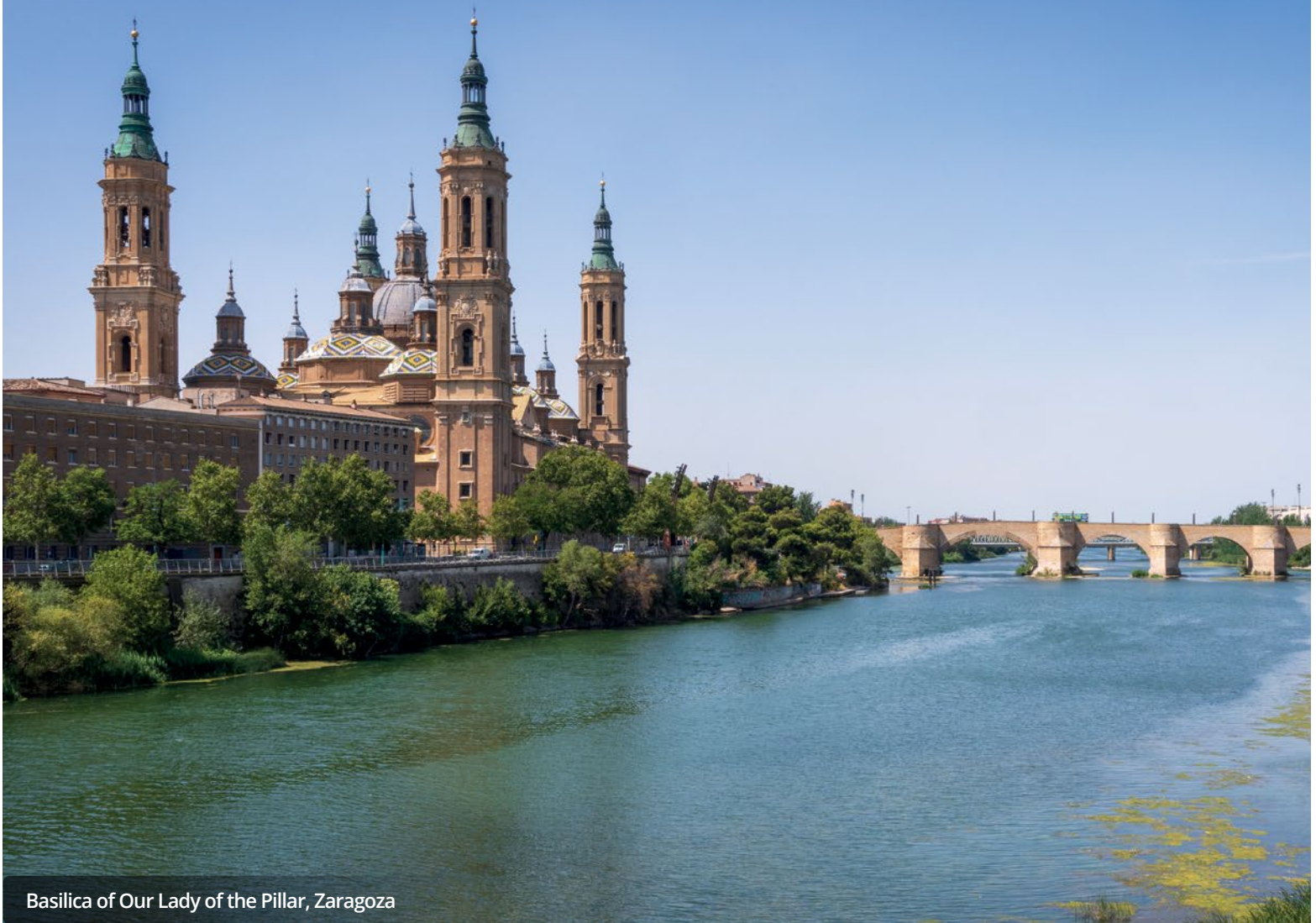
Basilica of Our Lady of the Pillar, Zaragoza

Fátima (2 nights) • Ávila (1) • Zaragoza (1) • Lourdes (2) • Rome (4)